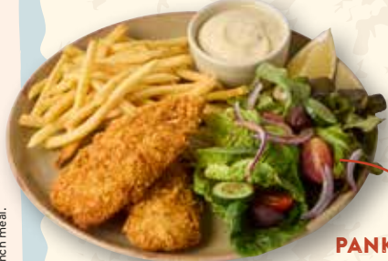
PANKO SNAPPER FILLETS $18.90

Pasta tubes filled with spinach & ricotta, oven-baked in Napoli, finished with cream, basil & baby spinach.