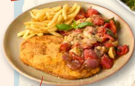
150G CAPONATA BEEF SCHNITZEL $17.90

Hand crumbed beef schnitzel served with a mushroom, capsicum, red onion, garlic, and tomato sauce. Topped with grated Parmigiano Reggiano and served with shoestring fries.