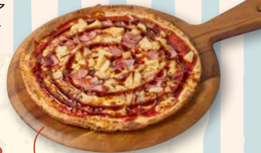
HAWAIIAN BBQ PIZZA $12.90

Traditional oven baked beef lasagne topped with mozzarella & Bolognese, served with chips & salad.