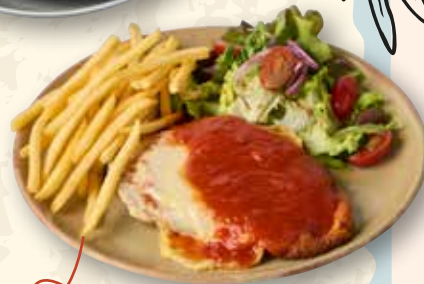
150G CHICKEN PARMIGIANA $17.90

Crispy panko snapper fillets served with garden salad, aioli, lemon & shoestring fries.