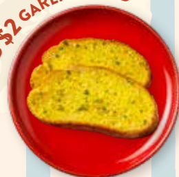
ADD $2 GARLIC BREAD*

Prawns sautéed with garlic, basil pesto & fresh tomato finished with cream, parsley & lemon.