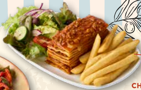
LASAGNE CHIPS & SALAD $12.90

Hand crumbed beef schnitzel served with a mushroom, capsicum, red onion, garlic, and tomato sauce. Topped with grated Parmigiano Reggiano and served with shoestring fries.