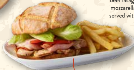
GRILLED CHICKEN BLT $12.90

Tomato base, ham, pineapple, red onion & mozzarella topped with BBQ sauce.