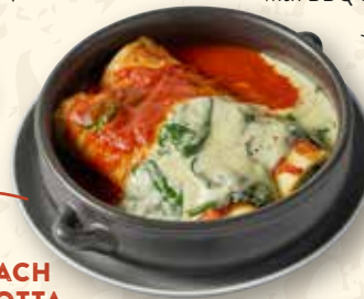
SPINACH & RICOTTA CANNELLONI (V) $12.90

Chargrilled chicken, garlic butter, bacon, cos lettuce, tomato & creamy Caesar dressing on a toasted bun served with chips.