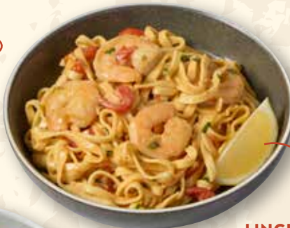
LINGUINE GARLIC PRAWNS $12.90

Prawns sautéed with garlic, basil pesto & fresh tomato finished with cream, parsley & lemon.